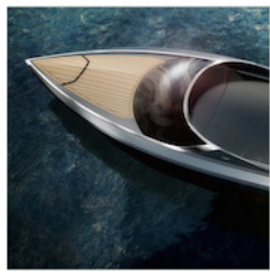
Aston Martin's new powerboat will be released in September

British automaker Aston Martin is introducing its first ever powerboat this year as part of a collaboration with Quintessence Yachts.