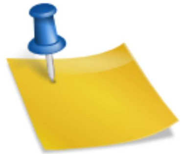
Slider bottom Banner