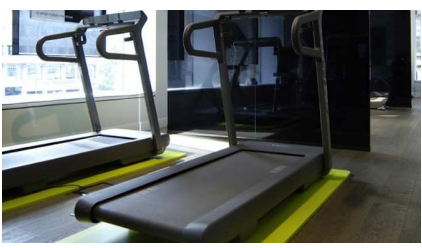
Myrun technogym treadmill