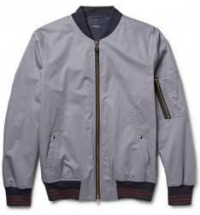
PS BY PAUL SMITH COTTON BOMBER JACKET