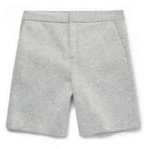
ALEXANDER WANG T BY ALEXANDER WANG NEOPRENE SHORTS