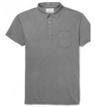
OFFICINE GENERALE GARMENT-DYED COTTON POLO SHIRT