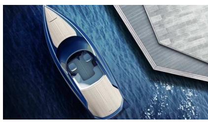
Quintessence yachts collaborate with Aston Martin for AM37 powerboat