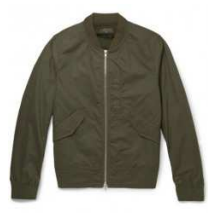
BEAMS PLUS COTTON-BLEND FLIGHT JACKET