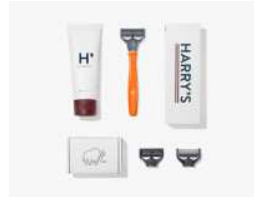
HARRY'S SS14 TRUMAN SET