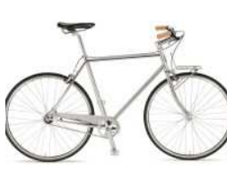
SHINOLA DETROIT ARROW BICYCLE