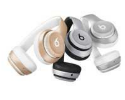
BEATS APPLE- INSPIRED SOLO2 WIRELESS COLLECTION