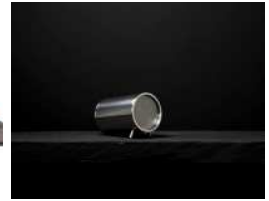
WIRELESS LEFF SPEAKER BY PIET HEIN EEK