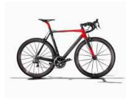
AUDI SPORT RACING BIKE