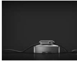
NOMAD APPLE WATCH CHARGER