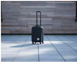
HERSCHEL SUPPLY CO. SPRING 2015 TRAVEL COLLECTION