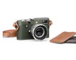
LEICA M-P 240 "SAFARI" EDITION