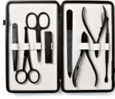
CZECH AND SPEAKE MANICURE SET