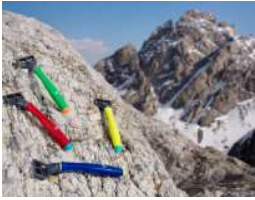
HARRY'S X JIMMY CHIN RAZOR