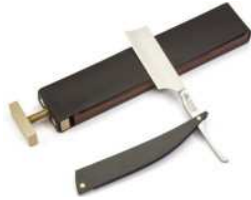
BISON RAZOR AND PADDLE STROP CASE