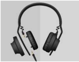
AIAIAI TMA-2 MODULAR HEADPHONES