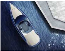
ASTON MARTIN X QUINTESSENCE YACHTS AM37 POWERBOAT