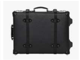
REISS X STEAMLINE LUGGAGE