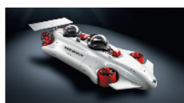
DeepFlight Dragon submersible 06/12/2015