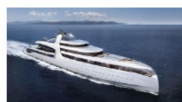
Pininfarina OttantaCinque 85m luxury yacht 05/12/2015