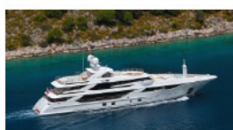
Benetti Vica superyacht 15/12/2015